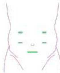
LAPAROSCOPIC PORT INCISIONS