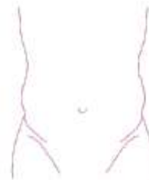
TAMIS NO SKIN INCISION